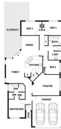
18 BARTON LOOP PIARA WATERS