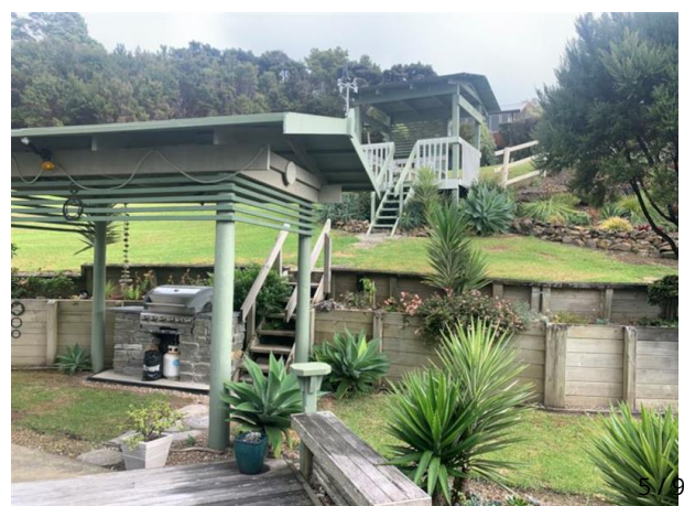
Barfoot & Thompson Mangawhai