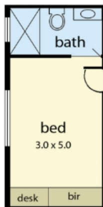
'Typical Floor plan' 52 Childers Street, Cranbourne