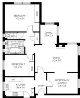
APARTMENT FLOOR PLAN