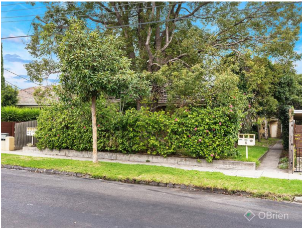
5/5 Lord St, Caulfield East