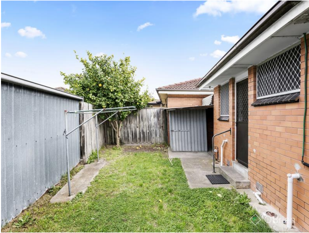
1/26 Allan St, Noble Park