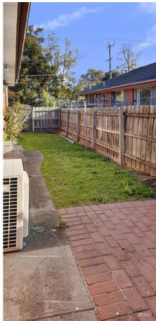
4/35 Athol Road, Noble Park