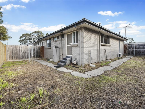
11/3-7 Harold Rd, Springvale South