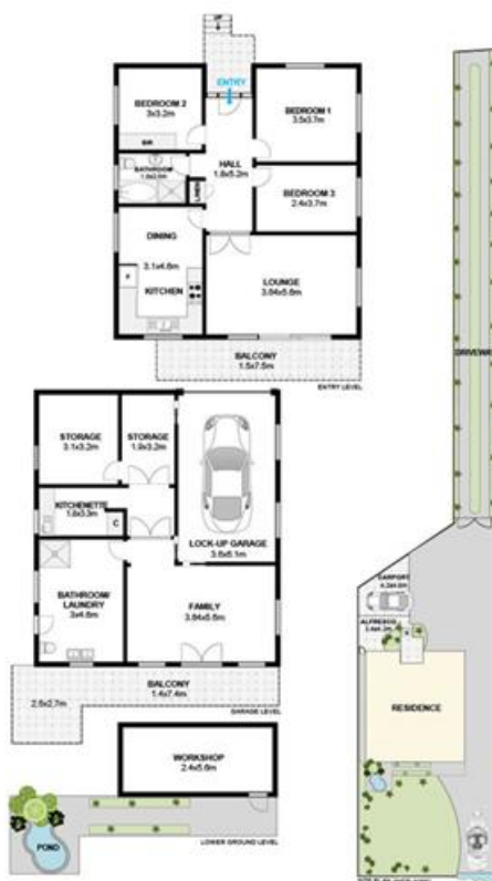
41 Burns Crescent Chiswick