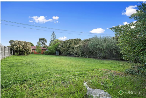
11 Windella Cr, Glen Waverley