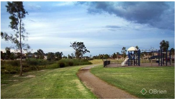
37 Cafardi Boulevard, Keysborough