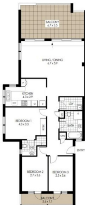
APARTMENT FLOOR PLAN