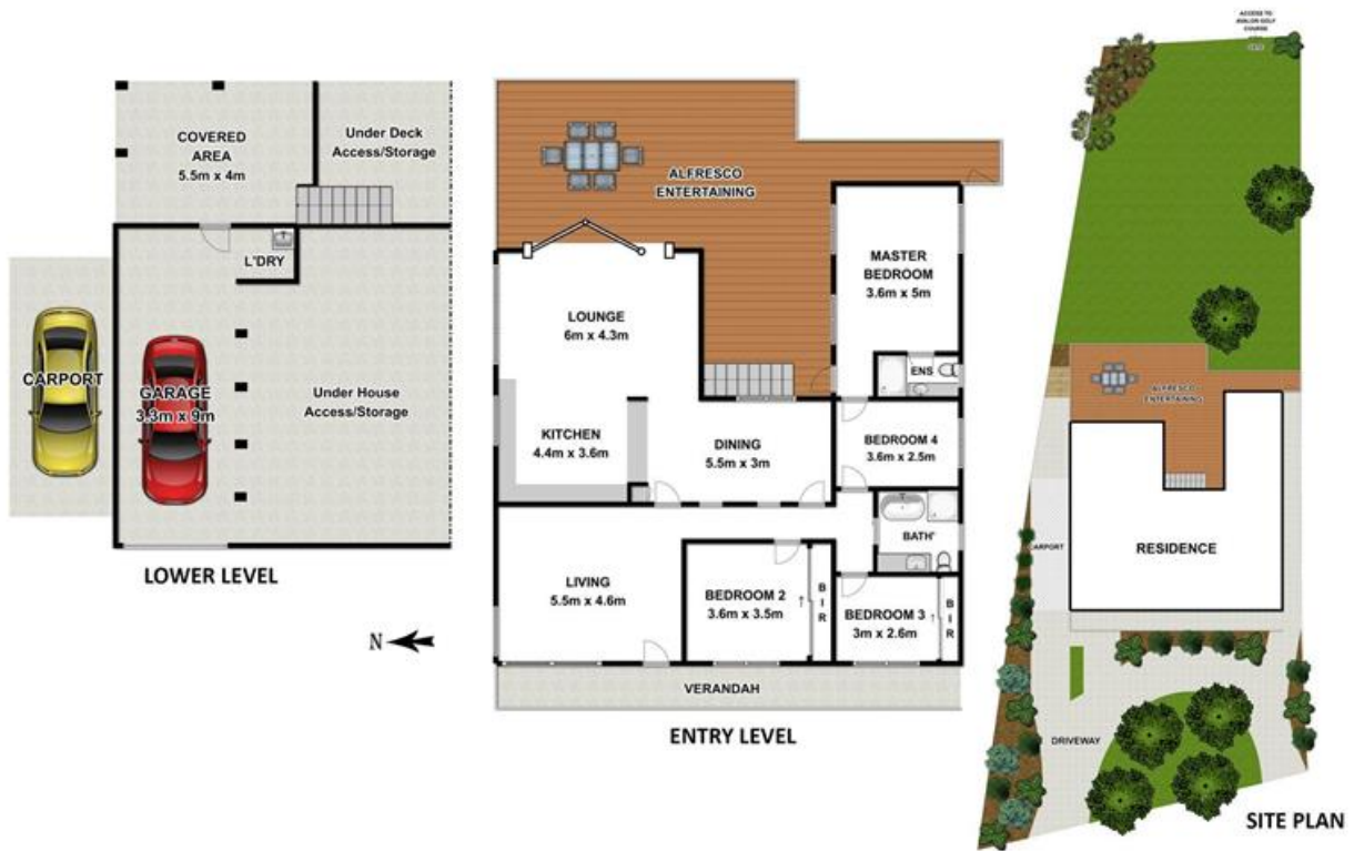
18 Old Barrenjoey Road, AVALON BEACH

Measurements are approximate. Not to scale. Illustrative purposes only