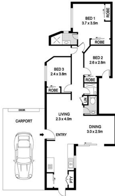
94D OWTRAM ROAD, ARMADALE

DISCLAIMER PLANS SHOWN ARE FOR MARKETING PURPOSES ONLY. ALL DIMENSIONS ARE APPROXIMATE AND NOT TO SCALE. THEY ARE SUBJECT TO ERRORS AND INCONVENIENCES AND NO LIABILITY WILL BE ACCEPTED. INTERESTED PARTIES SHOULD MAKE THEIR OWN INQUIRIES.