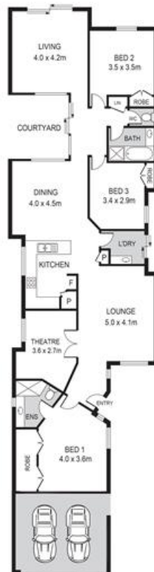
8B PEPPER AVENUE, SALTER POINT

DISCLAIMER: PLANS SHOWN ARE FOR MARKETING PURPOSES ONLY. ALL DIMENSIONS ARE APPROXIMATE AND NOT TO SCALE. THEY ARE SUBJECT TO ERROR AND INACCURACIES AND NO LIABILITY WILL BE ACCEPTED. INTERESTED PARTIES SHOULD MAKE THEIR OWN INQUIRIES.