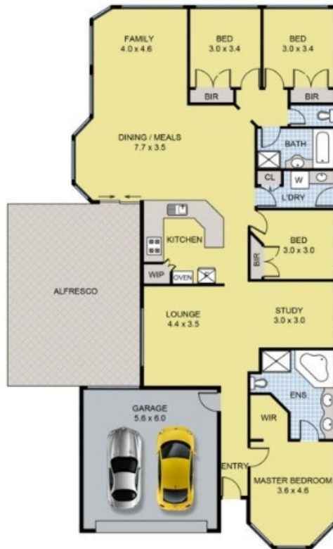
80 Ravenhill Blvd, Roxburgh Park