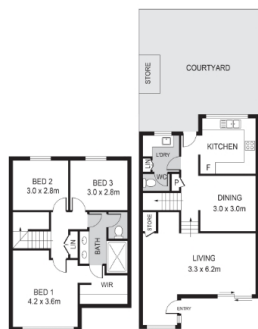
7/185 LABOUCHERE ROAD, COMO