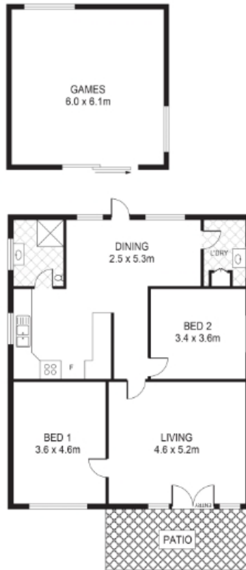
68 HUBERT STREET, EAST VIC PARK

DISCLAIMER PLANS SHOWN ARE FOR INFORMATION PURPOSES ONLY. ALL DIMENSIONS ARE APPROXIMATE AND SET TO SCALE. THEY ARE SUBJECT TO SURVEY AND INSPECTION. ACCEPTED LIABILITY WILL BE ACCEPTED. REFERENCED PARTS SHOULD MAKE THEIR OWN INQUIRIES.