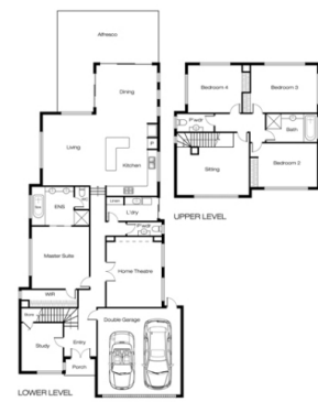
61A Henning Crescent MANNING