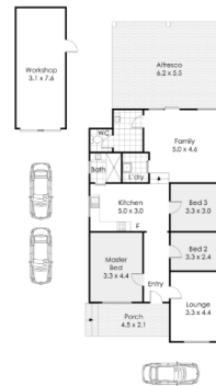
6 Wattle Street, South Perth

This floor plan is not to scale. Dimensions are approximate and therefore should only be used for illustrative purposes.