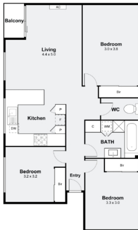
6/99 Barkly Street, St Kilda