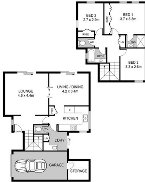
6-8 HENSMAN STREET, SOUTH PERTH

DISCLAIMER: PLANS SHOWN ARE FOR MARKETING PURPOSES ONLY. ALL DIMENSIONS ARE APPROXIMATE AND NOT TO SCALE. THEY ARE SUBJECT TO ERRORS AND INACCURACIES AND NO LIABILITY WILL BE ACCEPTED. INTERESTED PARTIES SHOULD MAKE THEIR OWN ENQUIRIES.