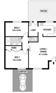
6-75 CLYDESDALE STREET, COMO

Disclaimer: This plan is for information only and does not constitute an offer of any financial product. It is subject to change without notice. For more information, please contact your financial adviser.