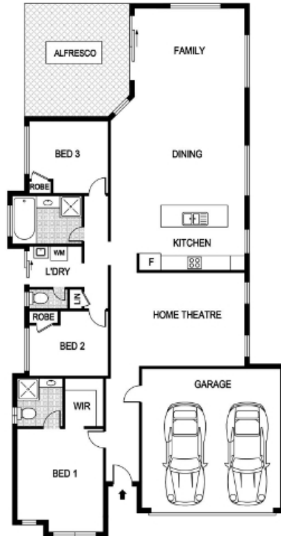
56 MACADAMIA, BALDIVIS

DISCLAIMER PLANS SHOWN ARE FOR MARKETING PURPOSES ONLY. ALL DIMENSIONS ARE APPROXIMATE AND NOT TO SCALE. THEY ARE SUBJECT TO SURVEY AND ENCOURAGEMENT AND NO LIABILITY WILL BE ACCEPTED. INTERESTED PARTIES SHOULD MAKE THEIR OWN INQUIRIES.