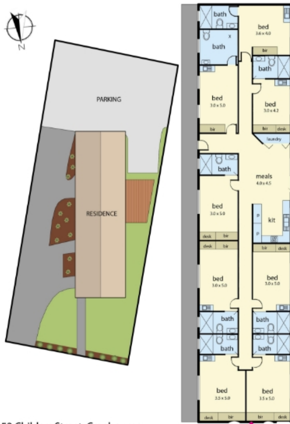
52 Childers Street, Cranbourne