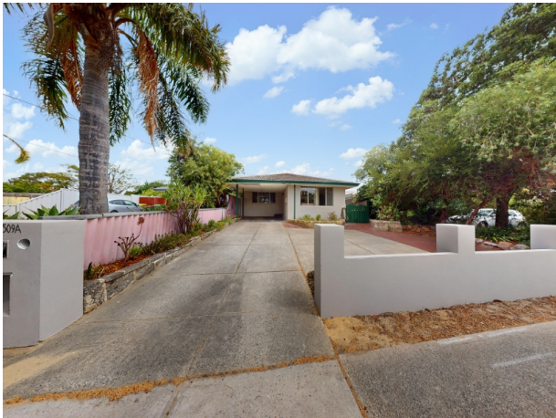
509A Leach Highway, Bateman