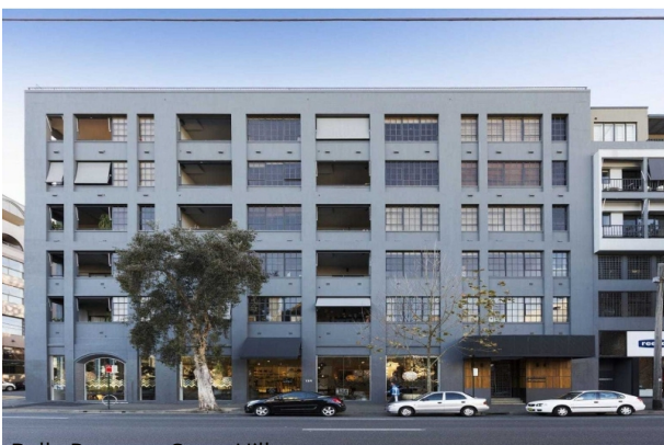
Belle Property Surry Hills