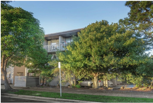
5/174 Murrumbeena Road, Murrumbeena