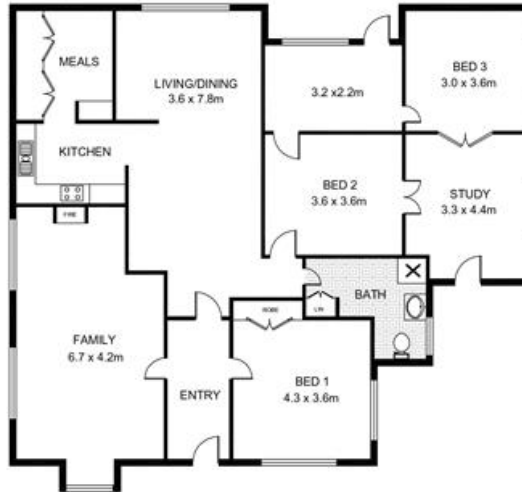
45 HAMPDEN STREET- SOUTH PERTH

PLANS SHOWN ARE FOR MARKETING PURPOSES ONLY. ALL DIMENSIONS ARE APPROXIMATE AND NOT TO SCALE. DIMENSIONS ARE SUBJECT TO SURVEY AND VARIANCES AND NO LIABILITY WILL BE ACCEPTED BY THE ARCHITECT FOR THE ACCURACY OF THESE DIMENSIONS.