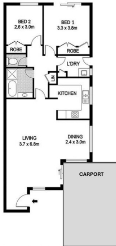
4-66 ERIC STREET COMO, PERTH

DISCLAIMER PLANS SHOWN ARE FOR INFORMATION PURPOSES ONLY. ALL DIMENSIONS ARE APPROXIMATE AND NOT TO SCALE. THEY ARE SUBJECT TO ERRORS AND INACCURACIES AND NO LIABILITY WILL BE ACCEPTED. INTERESTED PARTIES SHOULD MAKE THEIR OWN INQUIRY.