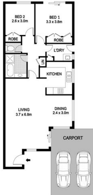
4-66 ERIC STREET COMO, PERTH

DISCLAIMER PLANS SHOWN ARE FOR MARKETING PURPOSES ONLY. ALL DIMENSIONS ARE APPROXIMATE AND NOT TO SCALE. THEY ARE SUBJECT TO CHANGES AND ENCLOSURES AND NO LIABILITY WILL BE ACCEPTED. INTERESTED PARTIES SHOULD MAKE THEIR OWN INQUIRIES.