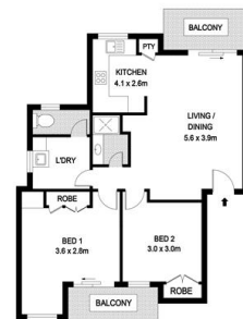
4-37 FLORENCE ROAD, WEST PERTH

DISCLAIMER This plan is a guide only and does not constitute an offer of any financial product. It is not intended to be used as a basis for investment decisions. The actual product may differ from the plan shown. Please contact your financial adviser for more information.