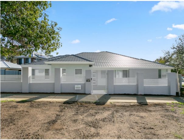
36A CONOCHIE CRESCENT MANNING