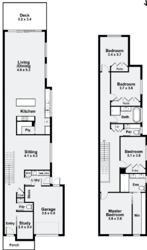
34a Parkmore Road, Bentleigh East

Whilst every attempt has been made to ensure the accuracy of this floorplan/diagram, measurements of doors, windows, rooms and any other items are approximate only. The producer or agent cannot be held responsible for any errors, omissions or misstatements. This plan is for illustrative purposes only and should be used as such.