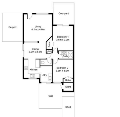
3/42 Lockhart Street, Como Living Area : 66.39m 2 Floor plans and site plans are for illustrative purposes only. They are not part of any legal document or title and are subject to errors, omission, and inaccuracies. Whilst every attempt has been made to ensure the accuracy of this plan, measurements of doors, windows, rooms, cupboards etc are approximate only.