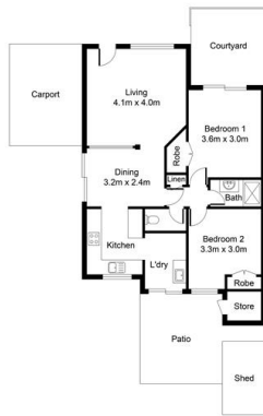
3/42 Lockhart Street, Como