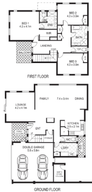
3-110 LABOUCHERE ROAD, SOUTH PERTH