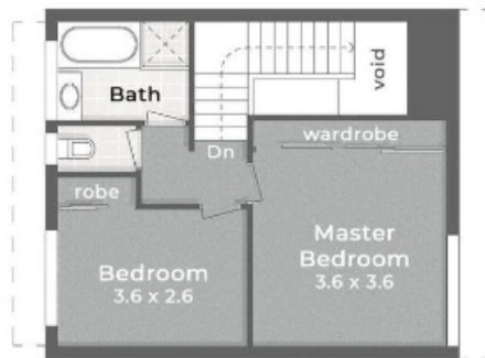
:: FIRST FLOOR