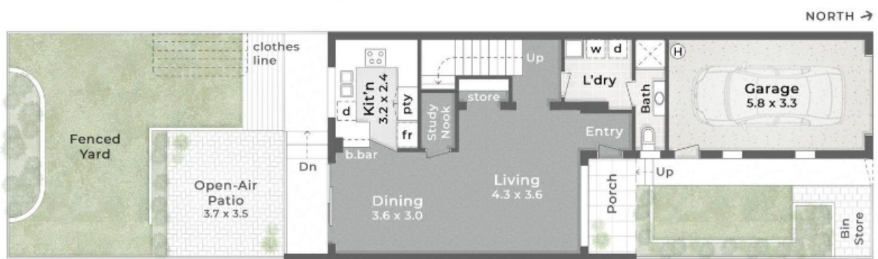
:: GROUND FLOOR & SITE PLAN