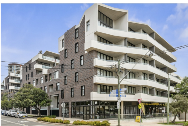
Belle Property Surry Hills