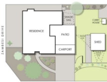
25 Zambesi Drive, Greenfields Prepared: 18/01/2024, 10:00 AM Total Area: 187sqm