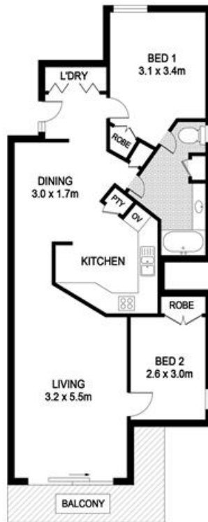
23-1 WESTON STREET, SOUTH PERTH

DISCLAIMER PLANS SHOWN ARE FOR MARKETING PURPOSES ONLY. ALL DIMENSIONS ARE APPROXIMATE AND NOT TO SCALE. THEY ARE SUBJECT TO ERROR AND INCONGRUENCIES AND NO LIABILITY WILL BE ACCEPTED. INTERESTED PARTIES SHOULD MAKE THEIR OWN INQUIRIES.