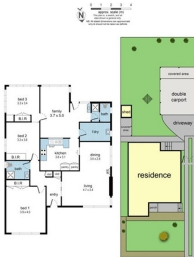
20 Perth Street, Blackburn South