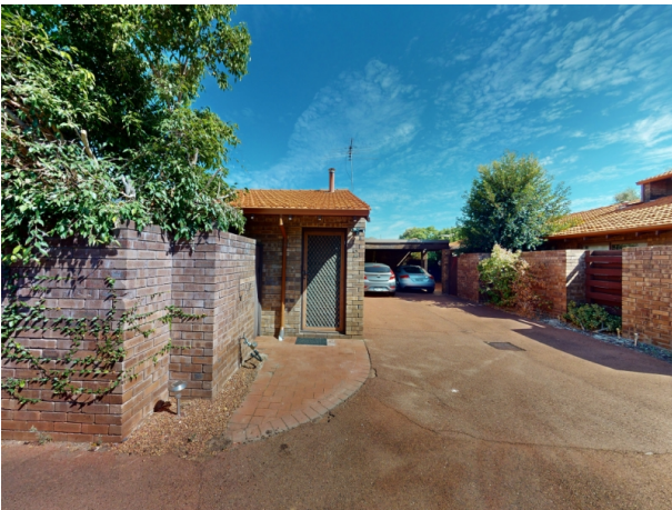
Unit 2, 58 Saunders Street, Como