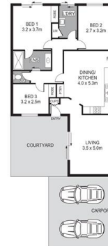
2/54 PARK SREET, COMO

PRELIMINARY THIS PLAN IS FOR INFORMATION ONLY AND IS SUBJECT TO CHANGE WITHOUT NOTICE. IT IS NOT TO BE USED FOR ANY OTHER PURPOSES.