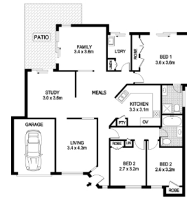
2-214 COODE STREET, COMO

DISCLAIMER: THIS PLAN IS A REPRESENTATIVE PLAN ONLY. THE ACTUAL PLAN MAY VARY FROM THIS REPRESENTATIVE PLAN. THE ACTUAL PLAN SHALL BE THE PLAN PROVIDED BY THE LOCAL AUTHORITY.