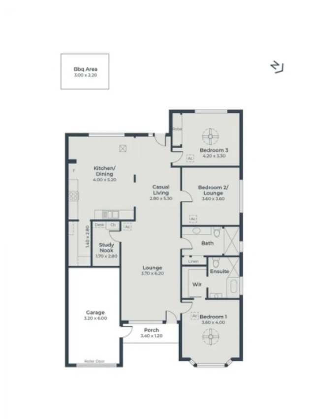
2/16 Fuller Street, Walkerville

The floor plan is not to scale, measurements are indicative and in metres. Exterior elements are not in position. Plans should not be relied on. Interested parties should make & rely on their own enquiries.