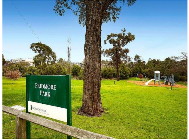
2/10A MASON STREET, HAWTHORN