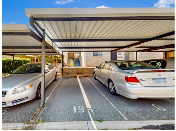
Unit 19, 79 Clydesdale Street, Como