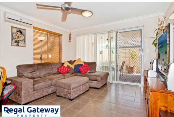
Regal Gateway PROPERTY