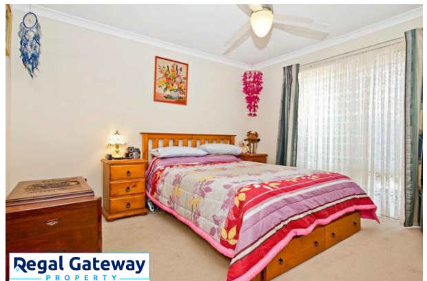
Regal Gateway PROPERTY