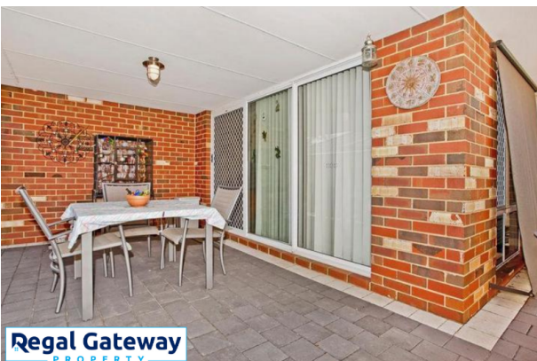
Regal Gateway PROPERTY