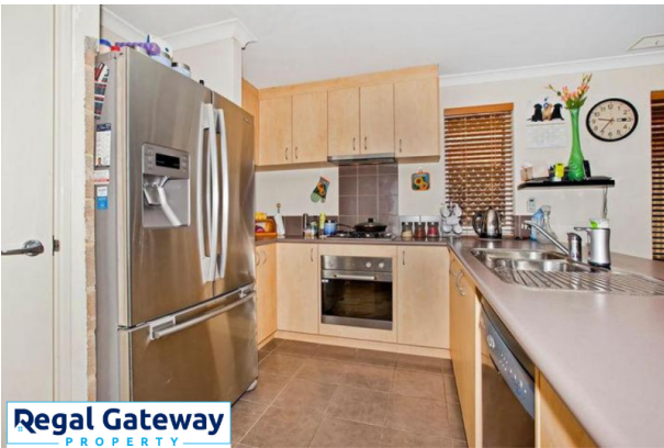
Regal Gateway PROPERTY