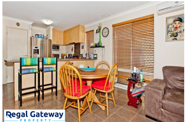
Regal Gateway PROPERTY