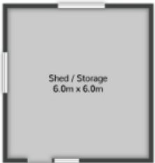
[Not In Position]