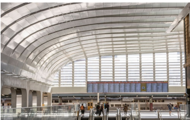
Belle Property Surry Hills